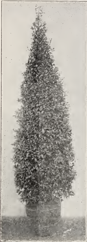
EUGENIA MYRTIFOLIA PYRAMID